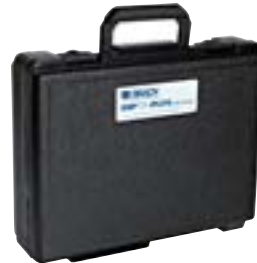
Hard Case Catalog #: BMP21-PLUS-HC

Li-ION battery ensures the power to print even on-the-go.