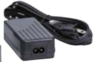
AC Power Adapter Catalog #: BMP21-AC

Heavy-duty magnet plus a flashlight and retractable stand.