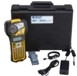
BMP®21-PLUS Printer Kit Catalog #: BMP21-PLUS-KIT1

Includes foam inserts and space to hold up to 6 cartridges or accessories.