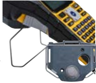
Multi-Functional Tool Catalog #: BMP21-TOOL

Heavy-duty magnet affixes printer to metal surfaces for hands-free printing.