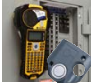
Magnet Attachment Catalog #: BMP21-MAGNET

Heavy-duty magnet affixes printer to metal surfaces for hands-free printing.