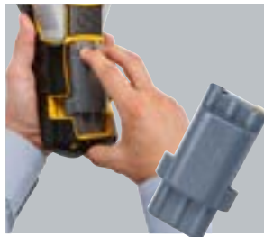
Li-ION Battery Pack Catalog #: BMP21-PLUS-BATT

Power printer from wall outlets. Doubles as a battery charger.