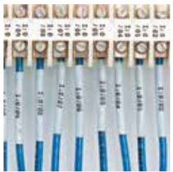
PermaSleeve® Wire Marking Sleeves