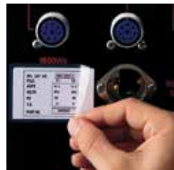
Asset / General Identification Labels