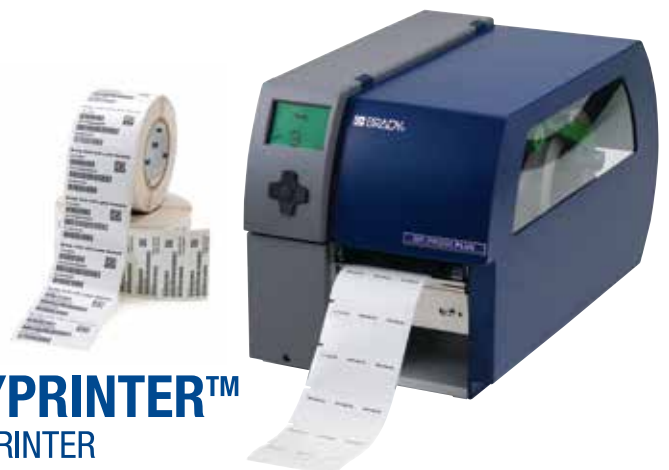
BRADYPRINTER™ PR PLUS PRINTER