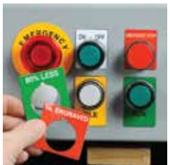
Raised Panel Labels